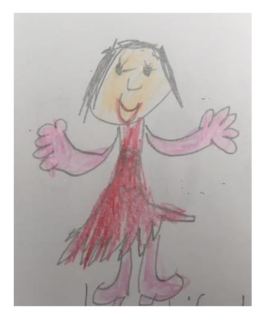
I put on a beautiful dress. It is beautiful. It is red.